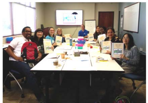
Attendees at the first “All Set” Workshop

We cover a wide range of topics including emergency supplies, evacuation, home sheltering, emergency savings, protecting critical documents, homeowners and renters insurance, home upgrades and more. Our first class was highly engaged, contributed great ideas, and left positive feedback. We are extremely excited to hold more All Set workshops in 2020!