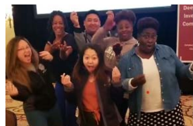
The team earned a reward from NeighborWorks America for completion of their community leadership survey.