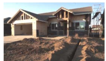
Williams 2: home in progress