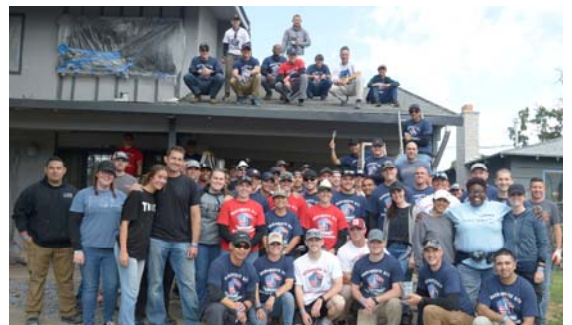
Sacramento Police Dept. North Command at Paint the Town