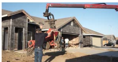
Williams 2: Dirt pouring for landscape