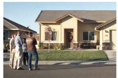
Williams 1: complete home