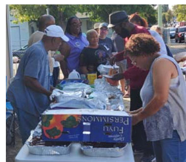
Neighbors in Del Paso Heights enjoying a Potluck to celebrate Paint the Town 2019!