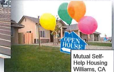
Mutual Self-Help Housing Williams, CA Group 1