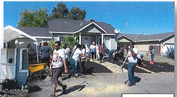
Paint the Town Del Paso Heights 2018