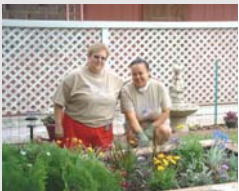
Paint the Town