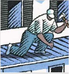
Home Improvement Loans