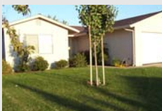
Down Payment Assistance/Closing Cost